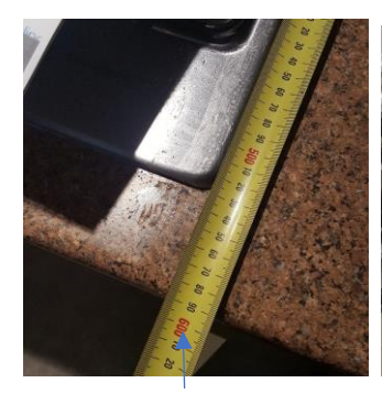
Standard 600 mm benchtop