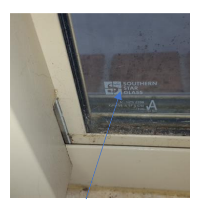
Single Low E safety glazing