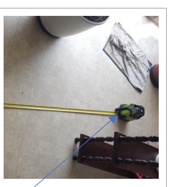
Gap under doors