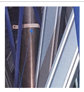
Flue through roof was correct