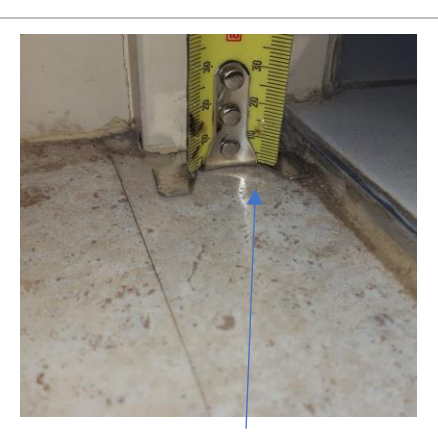
Level difference 9 mm