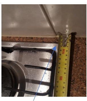
Offset to tile splashback