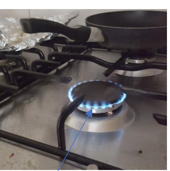
Low flame setting burner